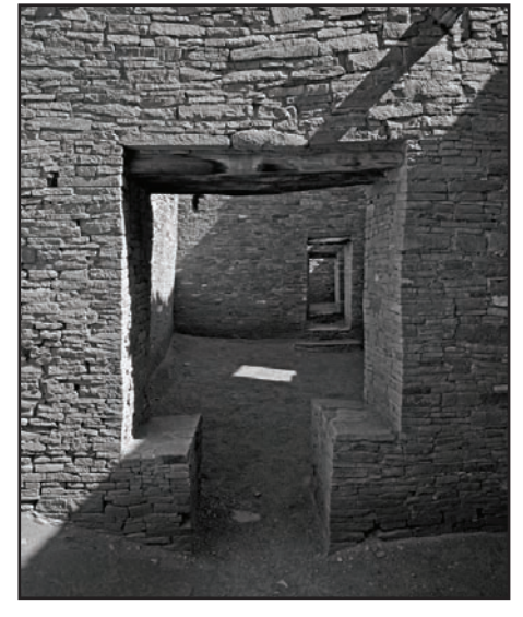
Doorways in Pueblo Bonito, Chaco Culture National Historic Park. New Mexico